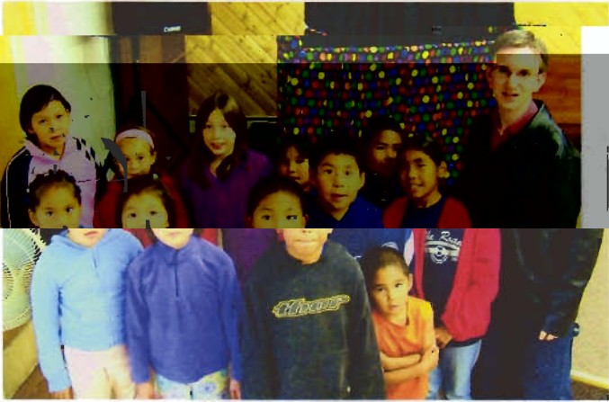
Children in Kiana.jpg