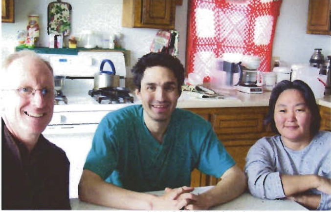
Marriage restored in Deering.jpg