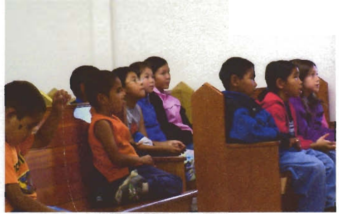
Attentive children in Kiana.jpg