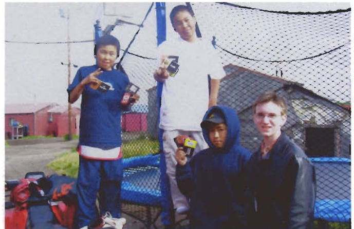
Youth in Kivalina.jpg