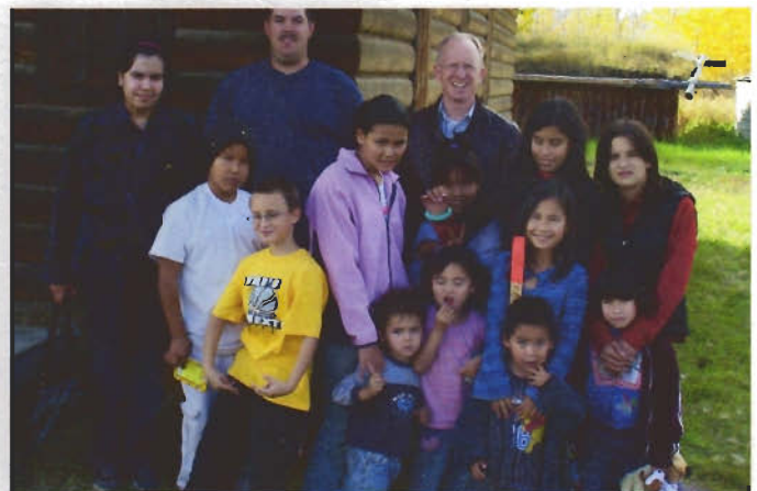
Children in Circle.jpg