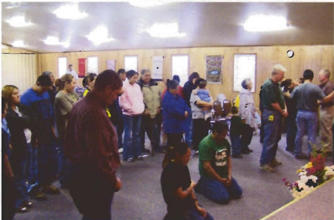
Altar service in Kivalina.jpg