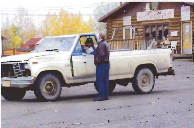
Reaching in Circle.jpg